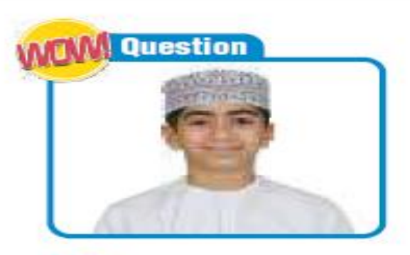
Sultan 3 minutes ago How can we keep safe outdoors?